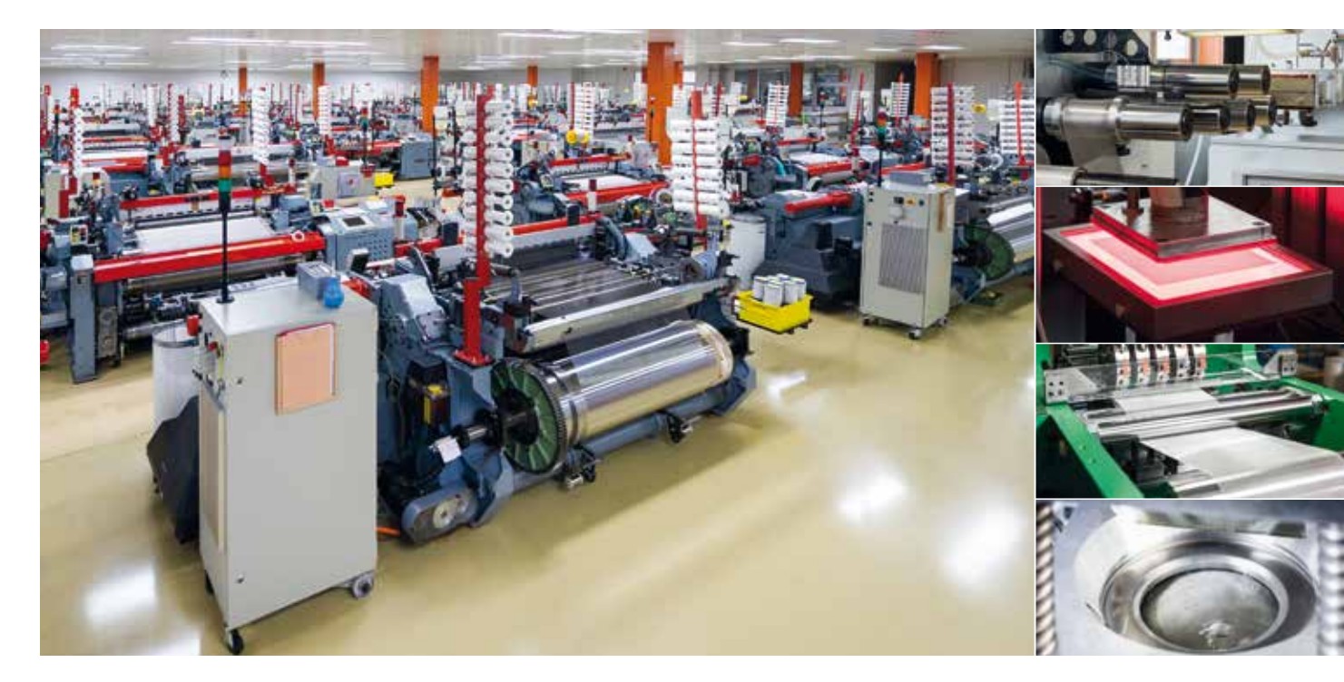
BOPP High Tech Mesh for Fuel Cell Technology